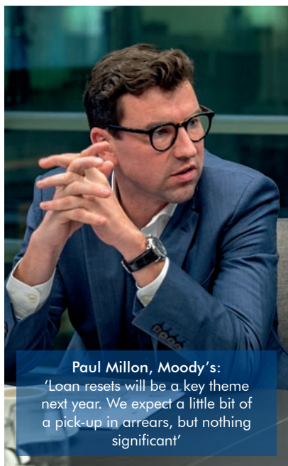
Paul Millon, Moody's: 'Loan resets will be a key theme next year. We expect a little bit of a pick-up in arrears, but nothing significant'

come to market with a transaction, you can do so within days of making that decision. Previously, if we were discussing what our funding options are and what markets are open to us over the coming days and weeks, our Silverstone RMBS programme was never a part of that conversation. Now it is very much part of that conversation alongside covered bonds, alongside senior funding, which puts it on a level playing field. We can use it in a lot more agile, reactive way to market dynamics and conditions, which is hopefully going to be positive for us, mainly, but also for investors, because they'll probably see more of it from us and benefit from the liquidity.